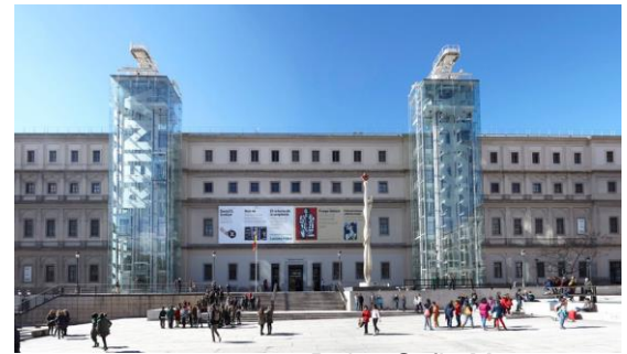
Reina Sofia Museum

In Madrid there are many museums, but the most important are: